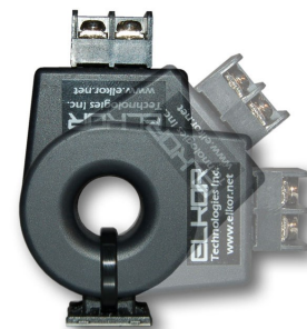
Universal mounting hardware for surface mounting